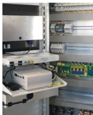
Cabinet with minimum amount of hardware and standard components.

Badische Stahl-Engineering GmbH RobertKoch-Straße 13 D-77694 Kehl/Germany Phone (+49) 78 51/877-0 Fax (+49) 78 51/877-133 eMail info@bse-kehl.de www.bse-kehl.de